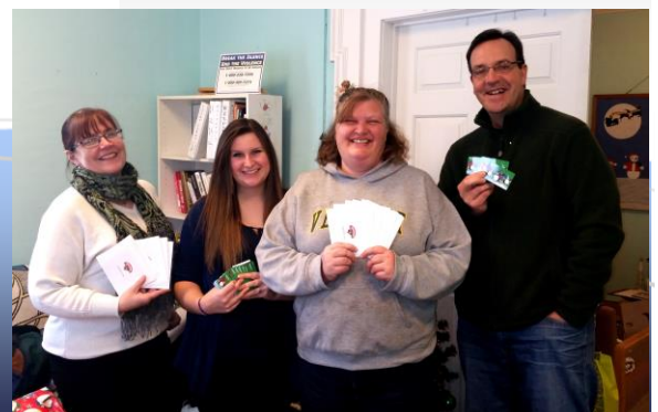
Right: RCWNS staff receives a donation from "Ted Arbos Toys for Tots" in December 2014